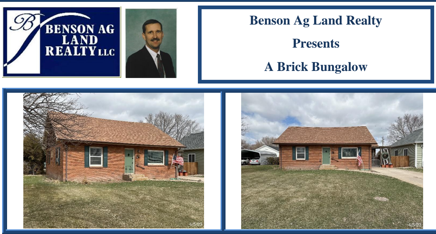
208 E 7<sup>th</sup> Street, Julesburg